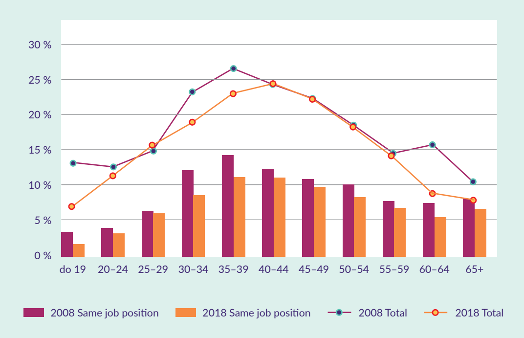
Graph 2: Comparison of age groups, 2008–2018, GPG in % of the average hourly wage, including bonuses, full-time work, total GPG and GPG for the same positions